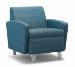
1571: Lounge Chair w/ Fully Upholstered Arms