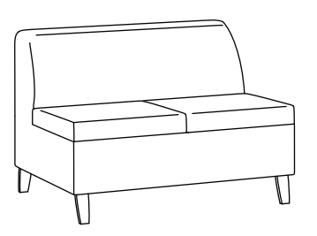
1572: Two Place Sofa