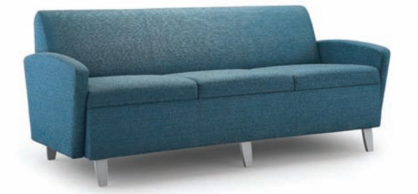
1573: Three Place Sota w/ Fully Upholstered Arms