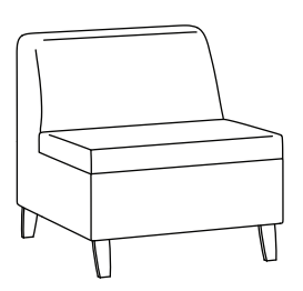
1571-X: Bariatric Lounge Chair