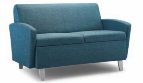
1572: Two Place Sofa w/ Fully Upholstered Arms