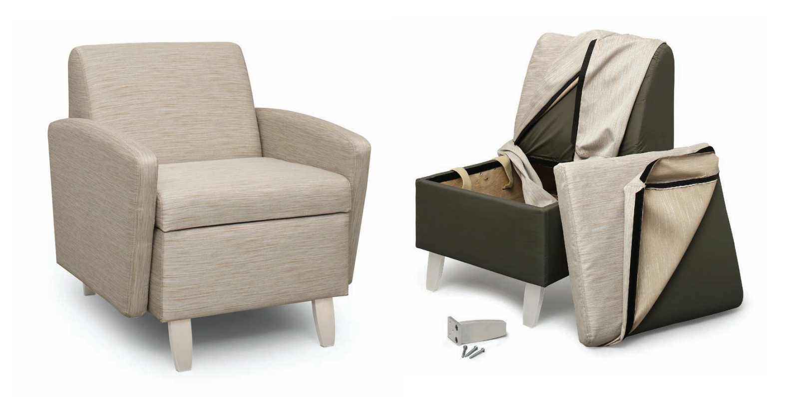
1571: Lounge Chair